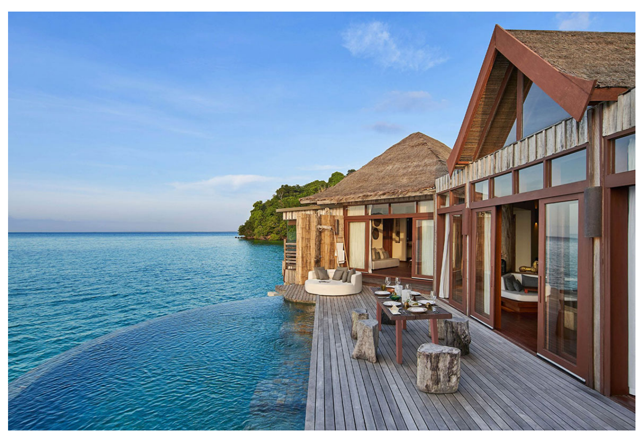
Villa exterior at Song Saa Private Island.

PADI divers, as well as dive orientation in our main pool and scuba review/refresher courses for anyone who's been a 'fish out of water' for too long. Whenever you come, you can expect to see a diverse abundance of corals and anemones as well as fish a plenty including scorpion, angel parrot, moray eels, seahorses, barracuda, Napoleon wrasse, trigger fish, puffer fish, rainbow runners, sting rays, octopus and horseshoe crabs, just to name a few.