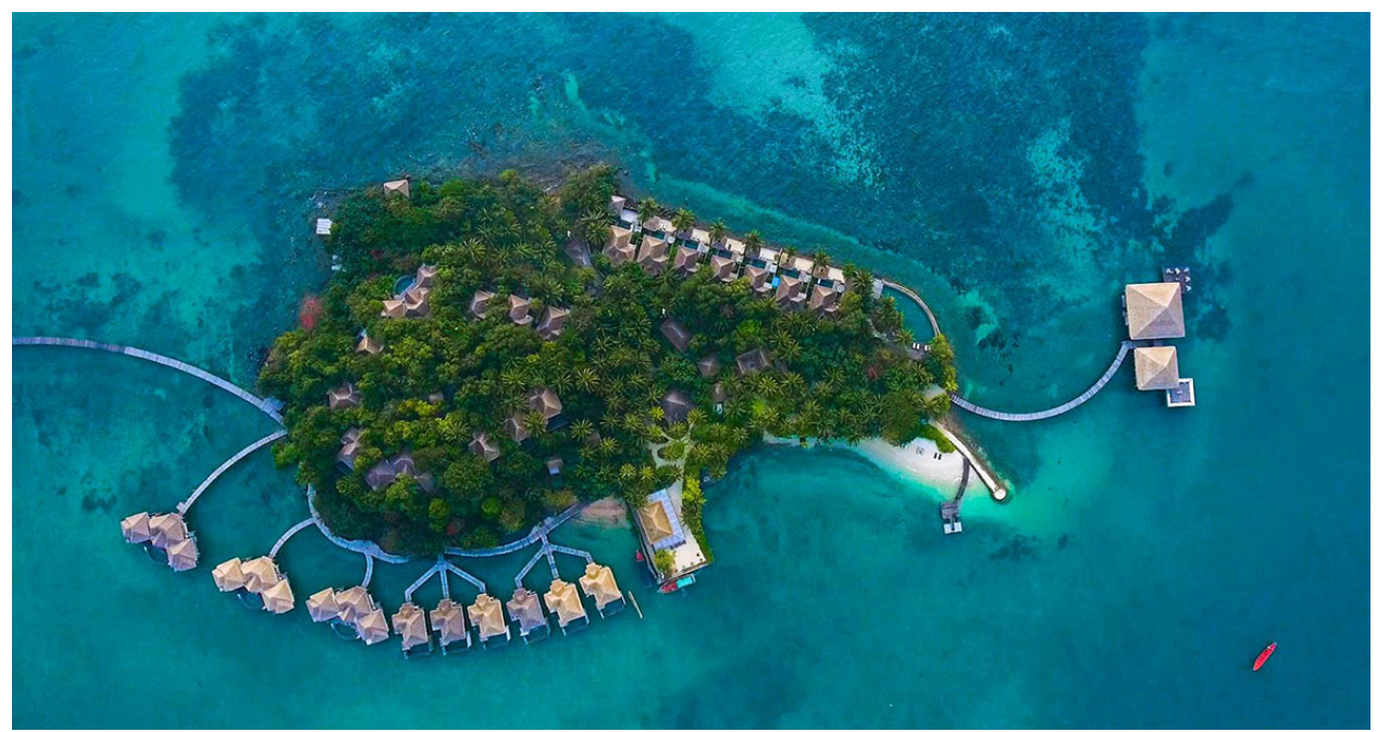
Song Saa Private Island from above.

took time to speak to Remote Lands about the future of travel in Cambodia.