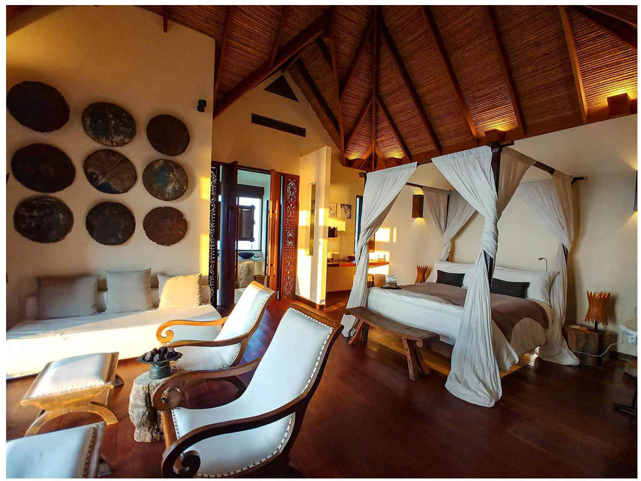
Royal Villa Interior.

As a private island experience, how does Song Saa Private Island mesh with trends for privacy in the post-Covid World?