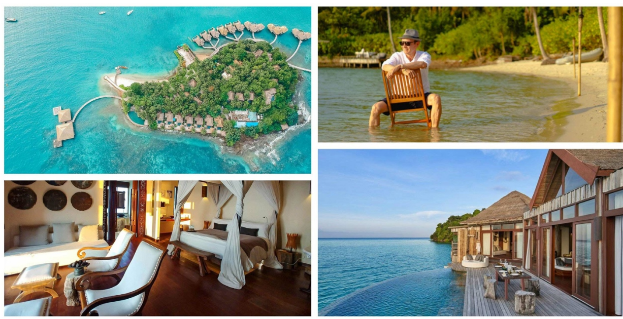
The return of international travel has heralded a new call for more intimate, private experiences, and in Cambodia, few can rival the likes of the Song Saa Private Island. Found a 45-minute speedboat ride from Sihanoukville, the ultra-luxe Song Saa Private Island is helmed by Donald Wong, who