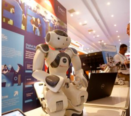
TECH Cambodia's Digital Natives Push Growth...