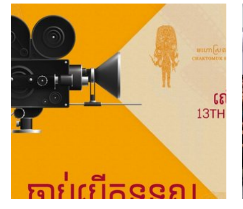
ARTS & CULTURE