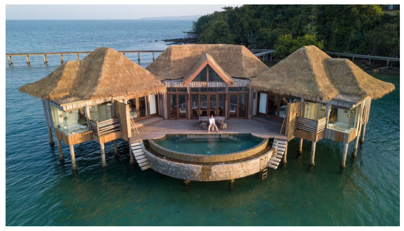
The three houses are build on a sea beach with a swimming pool in the middle. Sihanoukville, Koh Rong.

"As the country's reputation as a luxury travel destination grows, other hotels, tour operators, and service providers may also see increased interest and visitation."