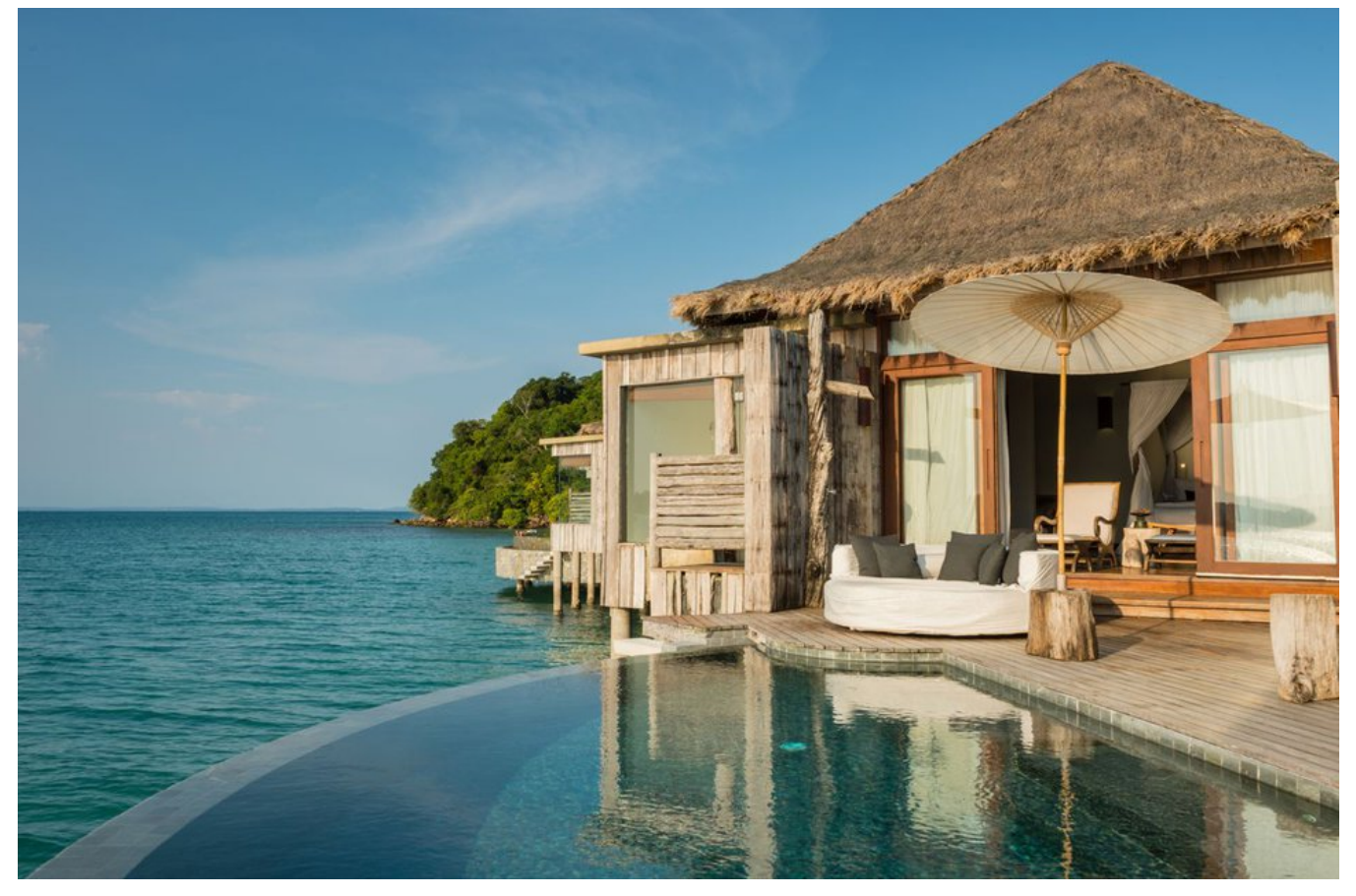
A landscape view of Song Saa private resort island. Sihanoukville, Koh Rong.

Sinan Thourn, chairman of PATA Cambodia and B2B Travel, believes Song Saa's recognition can be "highly beneficial" for the Kingdom's tourism industry as a whole.