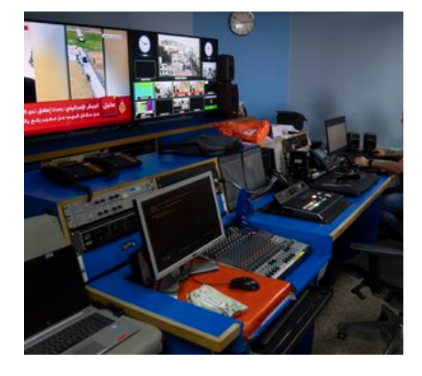
BUSINESS Israel Orders Al Jazeera to Close Its Local...