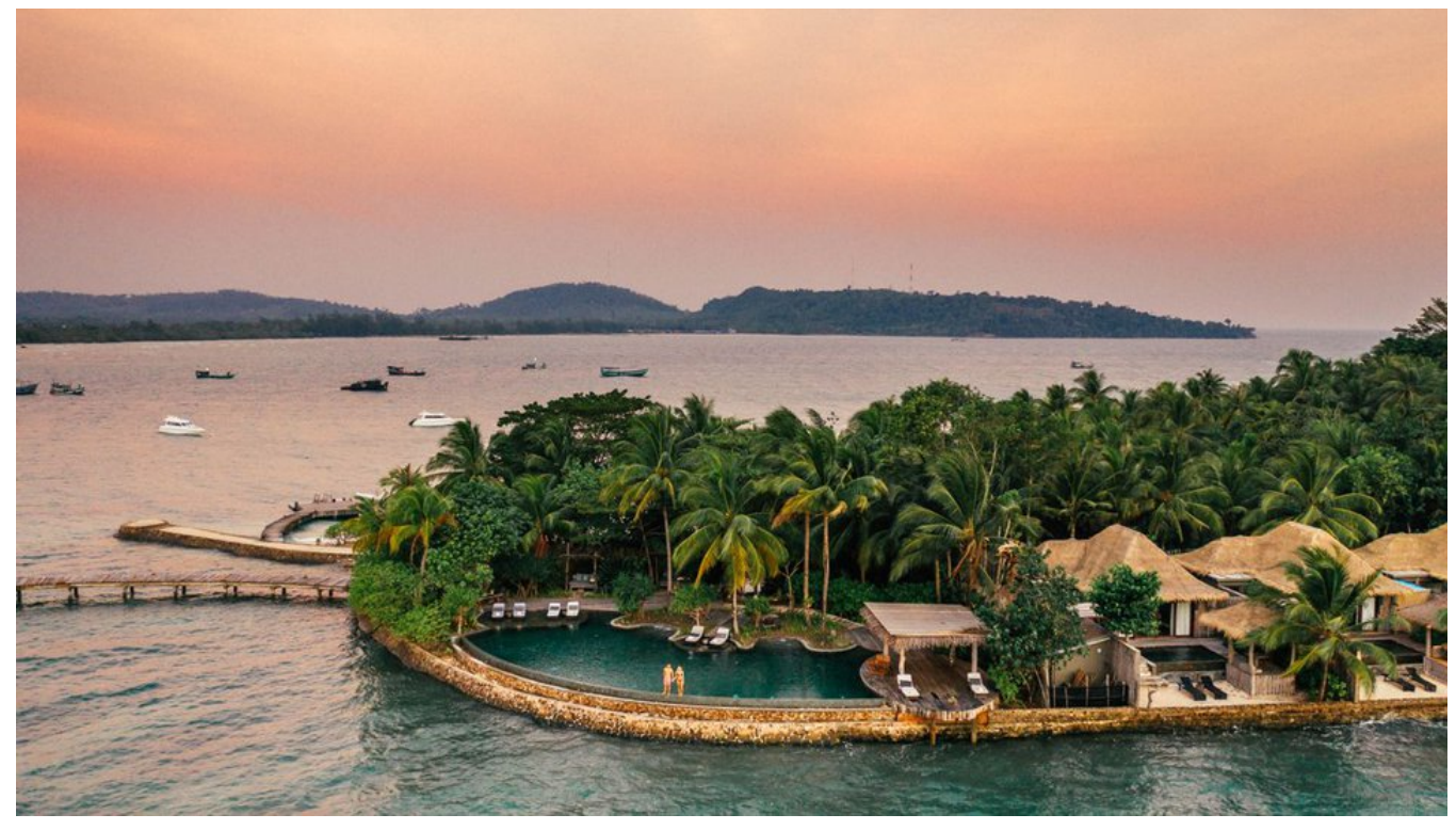
The Song Saa Private Island, Sihanoukville.

Song Saa has made it onto Conde Nast Traveler's prestigious Gold List for 2024's best hotels and resorts worldwide, with high hopes that it will have a ripple effect throughout Cambodia's tourism industry