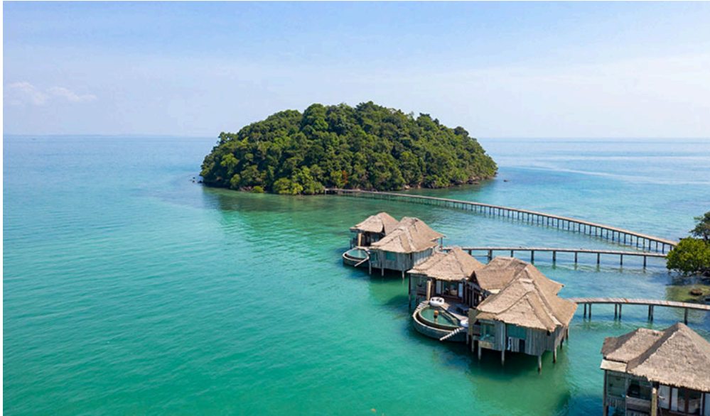
Song Saa Private Island is perfect for guests seeking total privacy in an idyllic island setting, Song Saa Private Island

Binici also noted new public infrastructure such as a comprehensive concrete road network island-wide, urban and road lighting networks being established, and most importantly, “the Koh Rong International Eco-Tourism Airport construction has already begun and is progressing at a great speed”.