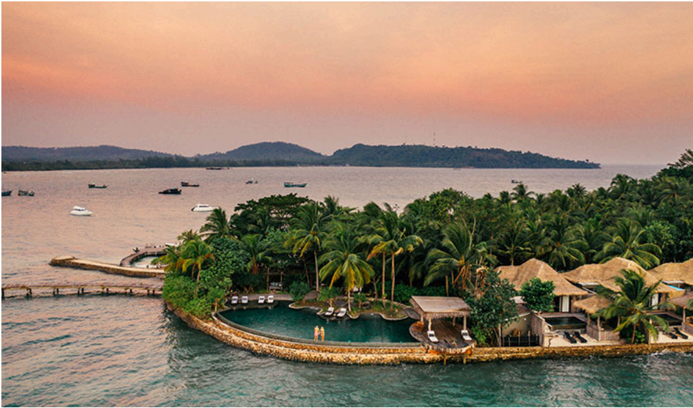
Song Saa Private Island located just off the coast of Koh Rong mainland is gaining worldwide attention and seemingly setting the bar high for other luxury ecotourism ventures. Song Saa Private Island

Rebibo explained that in comparison, however, last year’s low season, from May to October 2023, was exceptionally quiet, posing challenges for many hotels.